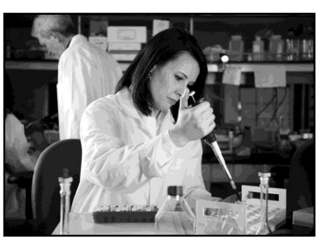
Laboratory Technologist Bachelor's degree Average salary = $56,130/year