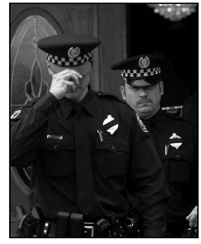
Police Officer/Sheriff's Patrol Officer Average salary = $53,540/year