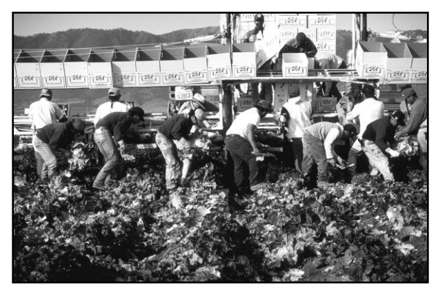
<u>Farm Worker</u> – Average salary = $18,960/year