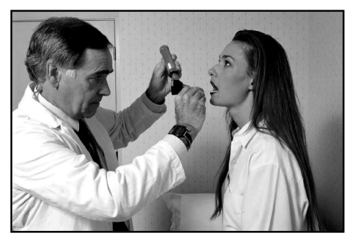
<u>Doctor/Surgeon</u> Doctoral or professional degree Average salary = more than $166,400/year