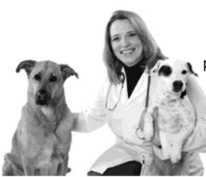
<u>Veterinarian</u> Doctoral or professional degree Average salary = $82,040/year