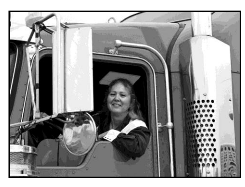
<u>Truck Driver</u> Average salary = $37,770/year