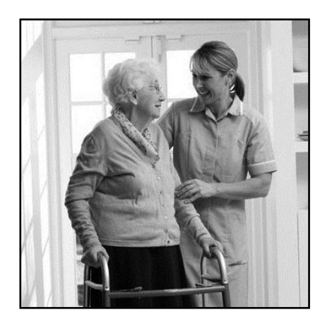
Home Health Aide Average salary = $20,560/year

<u>Cashier</u> Average salary = $18,500/year