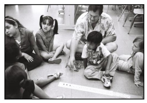
<u>Child Care Worker</u> Average salary = $19,300/year