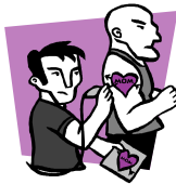
Getting a tattoo